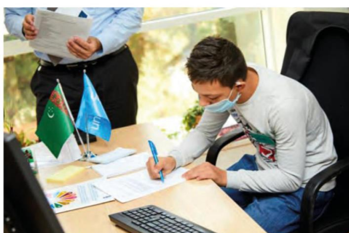
On World Children's Day, 2021 kids took over the UNICEF Office and approved the priorities stated in this Country Programme Document.