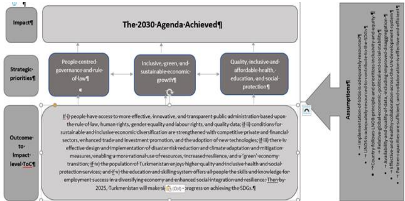
Figure 1: Cooperation Framework Theory of Change

27. An analysis of the assumptions across the outcomes and in the overarching theory of change provides the following set of critical assumptions in relation to the Cooperation Framework: i) Implementation of SDGs is adequately resourced; ii) The UN development system is adequately resourced to contribute to the SDGs; iii) The Government acknowledges 'leave no one behind' principle and prioritizes inclusivity and equity; iv) Relative global economic, political and social stability; v) Availability and quality of data, including improved disaggregation; vi) Effective and healthy collaboration across the UN development system; and vii) Partner capacities are sufficient, and collaboration is effective and efficient.